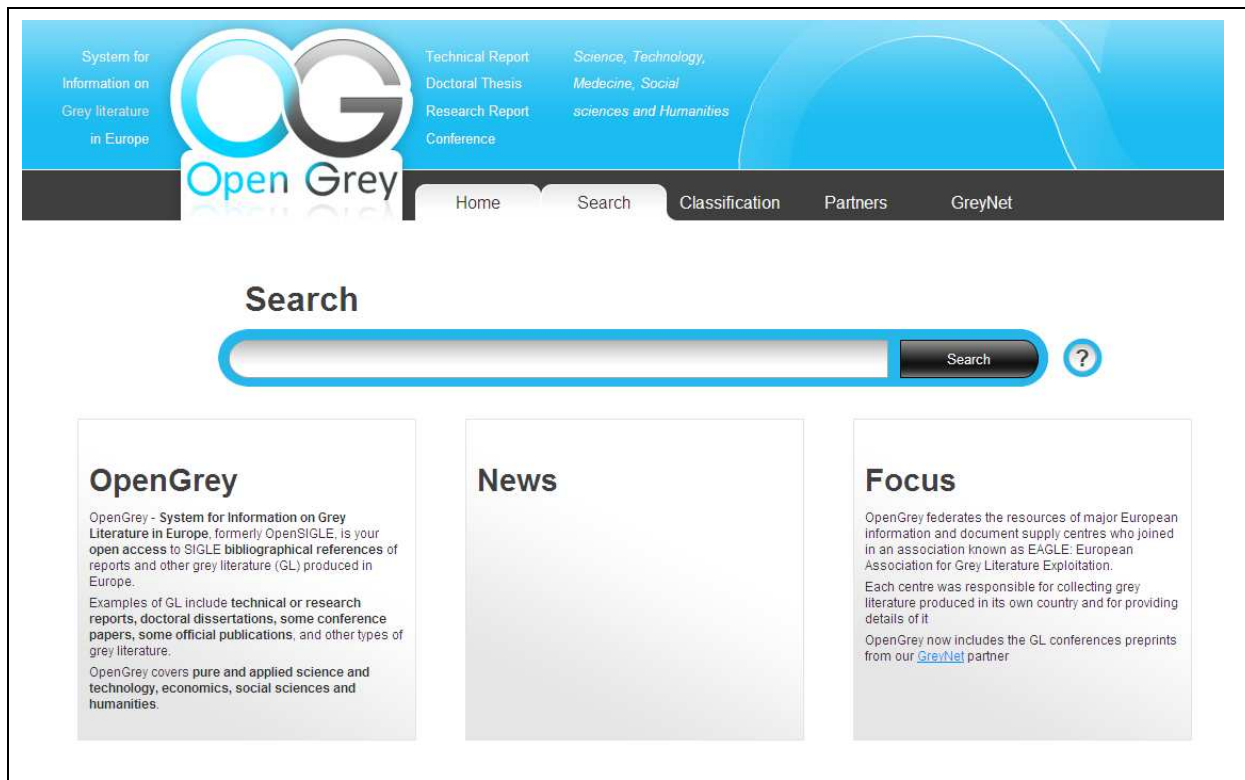
Figure 4: OpenGrey

For the next year, we plan to commence with an expanded partnership network to increase the number of records and electronic documents in the NRGL, to implement automatic indexing by the Polythematic Structured Subject Heading System, to cooperate with OpenGrey, and to continuously update Czech and English project web pages.