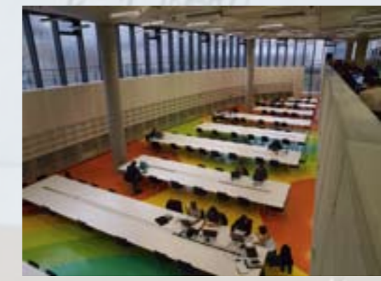
National Technical Library (NTK) http://www.techlib.cz/en/

The National Technical Library (NTK) in Prague in the Czech Republic is the central professional library dedicated to science and technology. The NTK aims to collect grey literature and to complement the role of the National Library of the Czech Republic, whose main task is to collect and preserve "white" literature. The NTK was the only active contributor and national coordinator of the SIGLE activities in the Czech Republic, but the SIGLE finished its activities in 2005. After the termination of the SIGLE, the NTK began with an initiative of collecting grey literature at the national level.