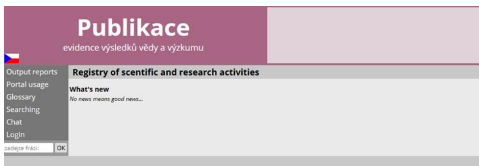
Figure 5: The “publikace.tul.cz system” interface (the interface is not available in English).

At present, the repository is still primarily a part of the TUL university library. It is only used by individuals or some departments and institutes, but does not yet serve as generally accepted support for science and research at TUL. Rather, it is perceived as a mere repository, a sort of organized virtual catacomb of interest only to individuals searching for full texts of theses. The question of why this is the case is not easy to answer. The library itself is responsible for actively distributing the repository content to a wider audience.