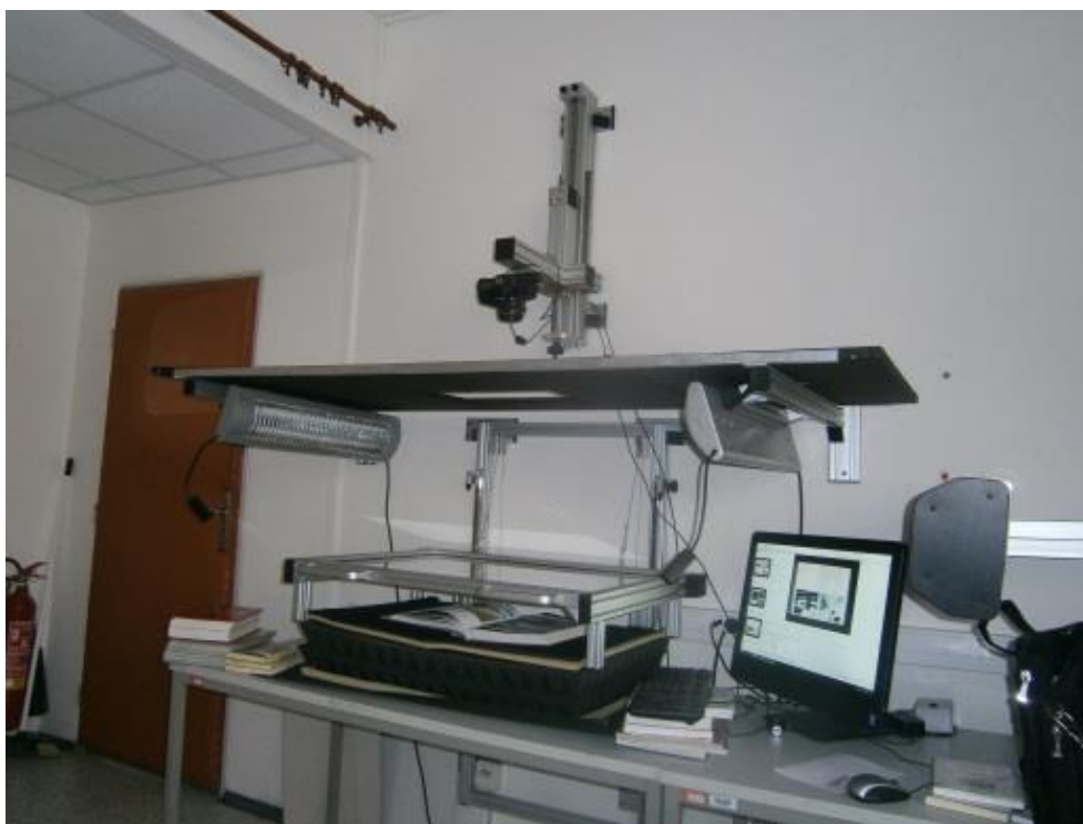
Figure 2: Digitization workplace

The second wave of digitization took place between 2008 and 2011. Theses from the entire history of the university were processed, i.e. from 1956 to the 1990s. The bindings of these theses were predominantly screwed together, and this complicated imaging. Hence the bound specimens had to be carefully cut open before scanning to ensure the subsequent scanning would be completely free of defects. For faster processing, imaging took place on a Canon scanner and images were processed in Capture Perfect - again into the resulting PDF files. Almost every thesis required individual settings depending on paper type and print strength. At the end of this period, the library could declare all the theses from 1956 to 2005 digitized. Since 2006, theses texts have also been submitted on compact discs in addition to print copies, and so the full texts were entered into the library system using those CDs.