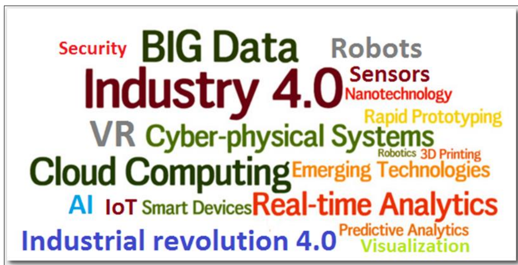
Figure 2: The Fourth Industrial Revolution pillars