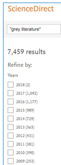
Figure 1: ScienceDirect search results

There have been many attempts to describe the concept of GL and to assign it a proper definition. The results achieved while doing this tell us that GL is much easier to describe than to define (Schöpfel, 2010).