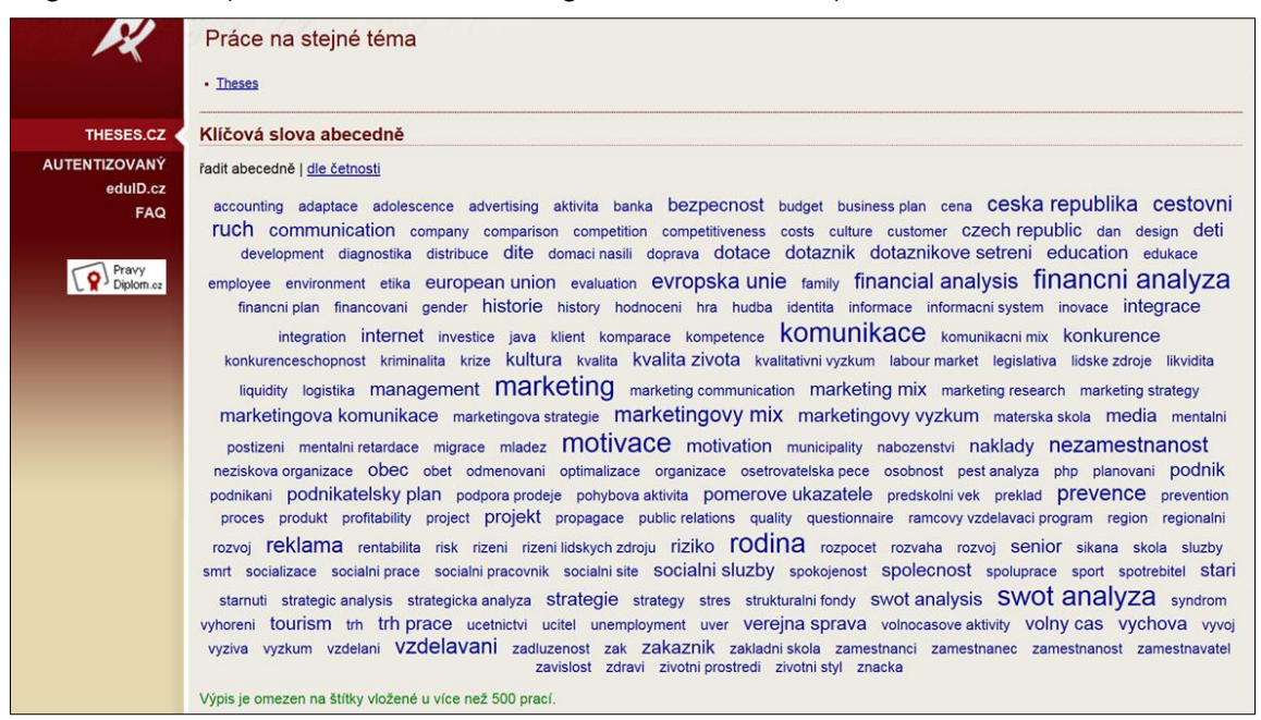
Figure 1: "Cloud" of alphabetically ordered common keywords in the Theses.cz system

The national register of theses – Theses.cz – managed by Masaryk University, serves, inter alia, for searching for records of these works and the works themselves. The user interface has not changed greatly for some years, is not particularly user friendly either when formulating queries or when evaluating the resulting lists of records and the presentation of full records. It offers searches by several formal data types (year of defence, name of university, etc.). Searches by type of work is surprisingly missing, this being replaced by a view of assigned degree names (however, the results might not be accurate).