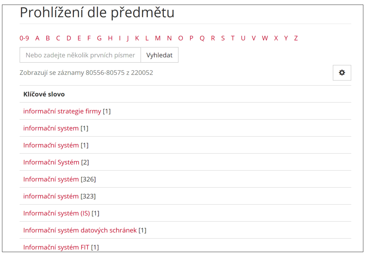
Figure 2: The index of "subject headings", or author keywords on the subject "informační systém" ("information system" in English) in the BUT repository (English equivalents are in a different part of the alphabet)

For the purposes of this paper, a small survey was performed of the description of the subjects of dissertations defended at selected Czech universities<sup>4</sup>, including outside digital repositories. The objective was to establish if subject description is better elsewhere, if the searchability of dissertations by subject is better elsewhere, and whether there is a chance – in the near future – to get linked records about them in the context of the semantic web. As Table 1 shows, the description of dissertation subjects is performed in institutional repositories (IR) exclusively through author abstracts (AB) and keywords (KW). Yet both elements – or even one of them – are however not usually present in many records at all (the policies of the universities differ in this area). At two universities, repositories either do not exist or do not include dissertations (Czech University of Life Sciences (CULS) Prague and Palacky University (PU) Olomouc), or the records are only available in the databases of the study systems.