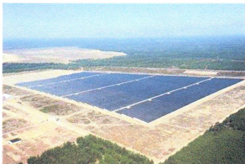
Fig. 2: Photovoltaic power station Lieberose in Germany

An area of 163 hectares which is recently covered by 560 thousand thin-layer solar panels used to be a military area and Soviet Army troops were trained here 20 years ago. Brandenburg government decided to lease the landplots for 20 years. The money from the landplots lease from the project investors should be used for the ecological remediation of the location, where a protected landscape area should emerge in 20 years. The companies which built the power station have undertaken to completely demolish it after the solar panels expire 10 .