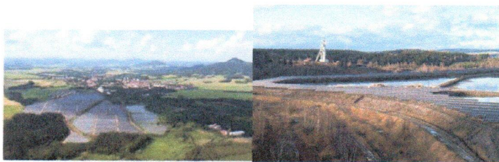
Fig. 3: Solar power station Ralsko Ra 1 in former military area and solar power station Rožná (DIAMO I.) in the area of uranium mining.

Up to now the investors are interested in photovoltaic devices only because these can be, contrary to wind turbines and biogas stations, mounted on a flat base and can be placed both on vacant areas (former landfills, military areas and airports, and demolished factories areas) and roofs of unused factories or cooperative farms.