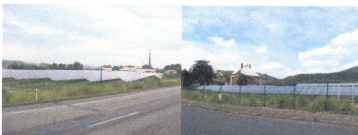
Fig. 4: Solar power station Slavkov u Brna (Southern Bohemia) in the place of a former sugar refinery and solar power station Libouchec in Northern Bohemia (former factory AZNP Mladá Boleslav)

http://www.realit.cz/clanek/vyuziti-brownfieldu-muze-byt-take-pouze-docasne