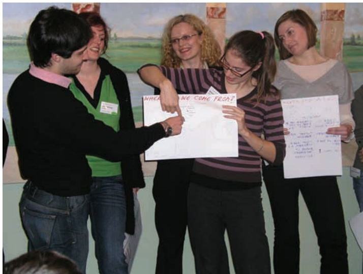
Teambuilding in Brussels