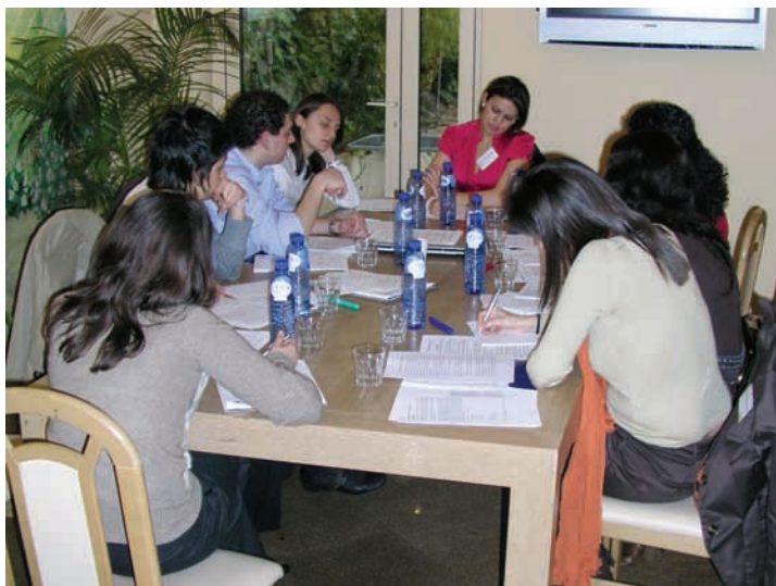
Workshop in Brussels