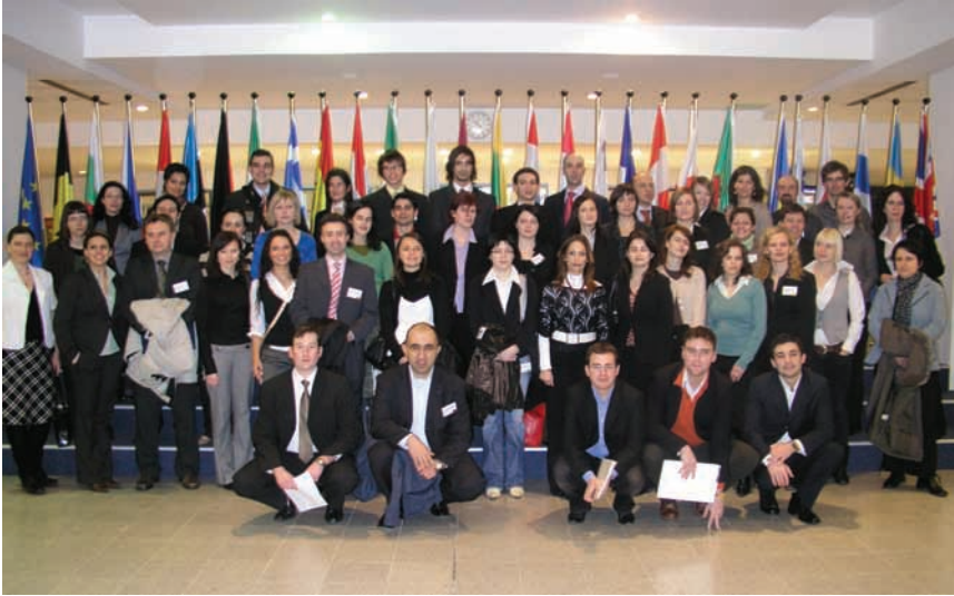
European Values Network 2008 in the European Parliament