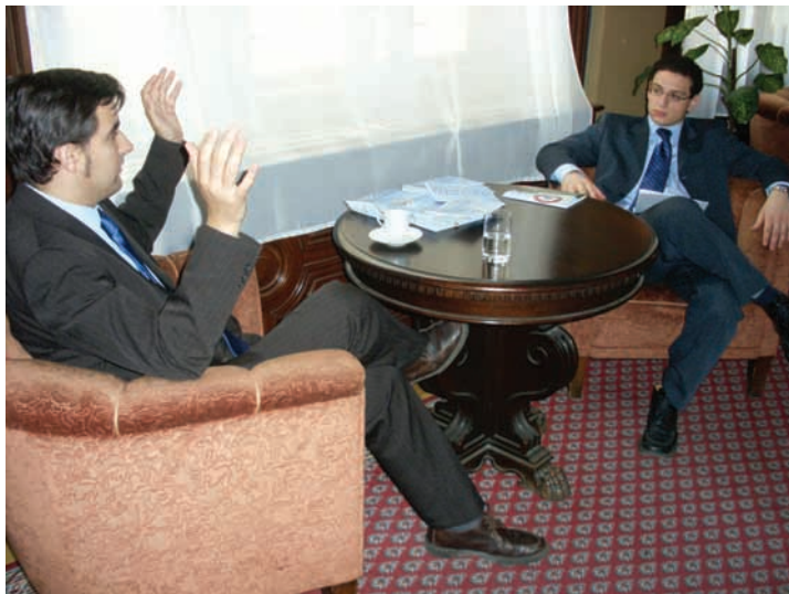
Debates of participants – workshop in Prague