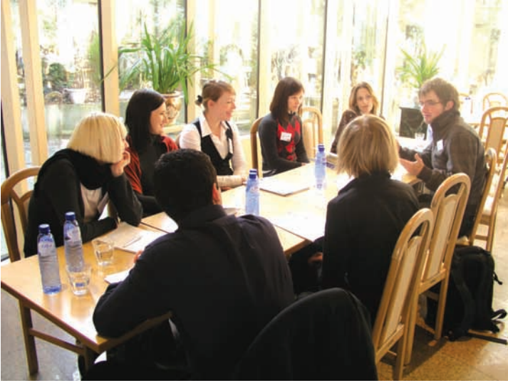
Workshop in Brussels