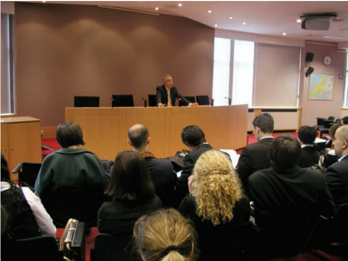
Discussion in the European Parliament with Mr. Alain Lamassoure MEP