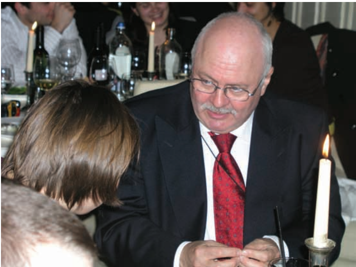
Mr. Josef Zieleniec MEP discussing with the EVN 2008 participants