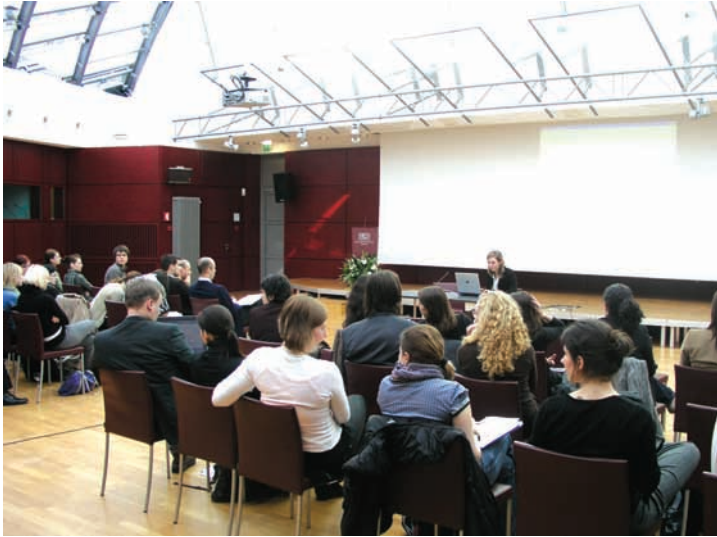
Workshop in the Bavarian Representation, Brussels