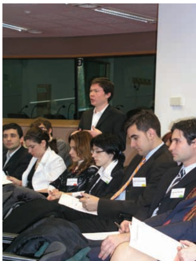
Discussions in the European Parliament